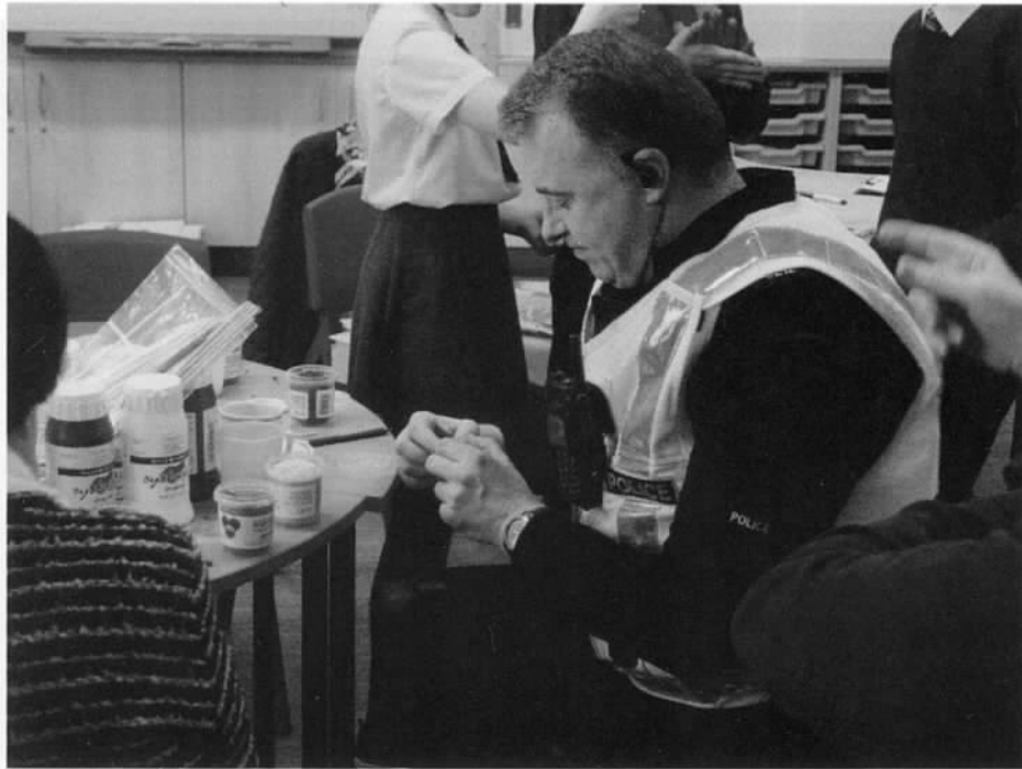
Discovering the community and local services...