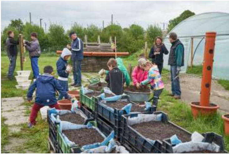
Intergenerational Urban Garden - Germany