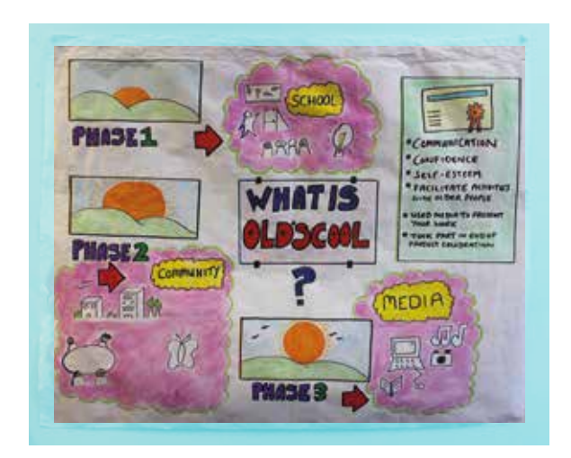
A 12 - 16 week programme is recommended when delivering the Old's Cool model and this is divided into 3 phrases.