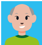
Wei Academic and Intergenerational Practitioner Scotland

Our organisation is dedicated to advancing intergenerational work and connecting people from around the world who want to make a positive impact. With your membership, you'll have access to a wealth of resources, including online training, events, and publications, as well as opportunities to connect with other volunteers and organisations. Whether you're looking to deepen your understanding of intergenerational practice or to take your volunteer work to the next level , Generations Working Together has everything you need to succeed. Sign up today and join us in building a brighter future for all generations.